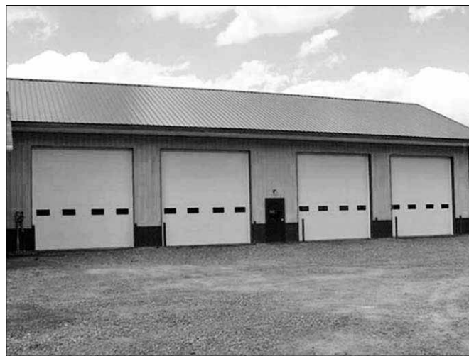
Sanataria Springs Fire Company's new addition is nearing completion.