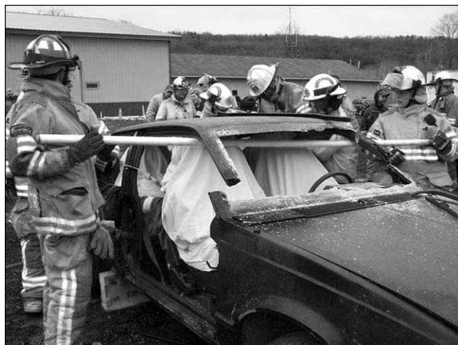
Sanataria Springs Fire Company's Auto Extrication class demonstrates getting passengers out of cars involved in accidents.